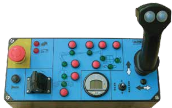
Control box IT 150 E