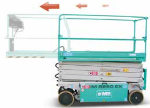
Manual deck extension 1.3 m