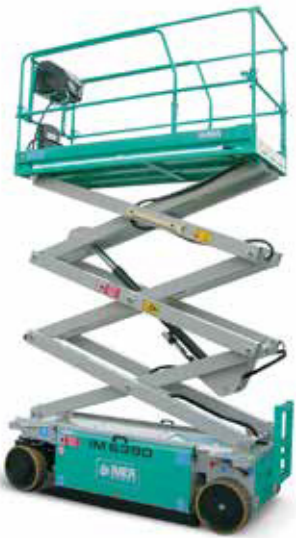
IM 6390 IM 6390 EX