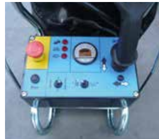
Sturdy, simple and intuitive control box on platform