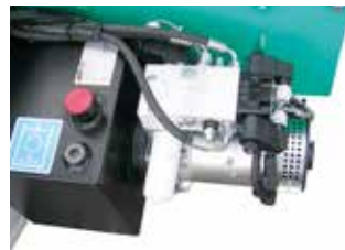
Hydraulic power pack