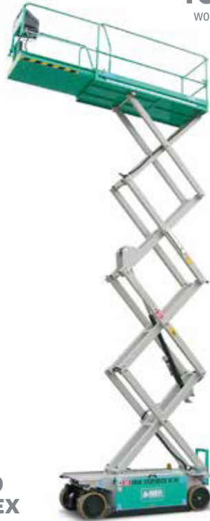
IM 8290 IM 8290 EX