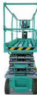
New design of the AWP and the scissor pack