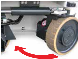
90° steering angle