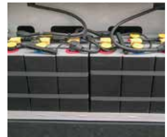
Large battery compartment to place higher capacity batteries