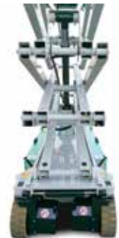
New design of the chassis which allows easy cleaning and ensures protection to the components