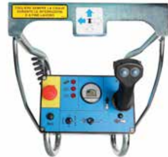
Sturdy, simple and intuitive control box on platform